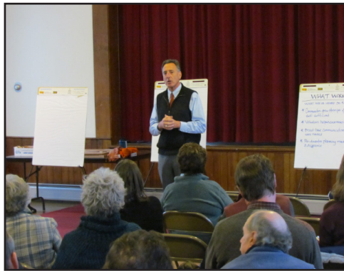
Governor Shumlin at 1/17 meeting.

To help municipalities with their long-term Irene recovery challenges, state officials have been meeting with the residents and members of municipal government in those towns that were hardest hit by Tropical Storm Irene.