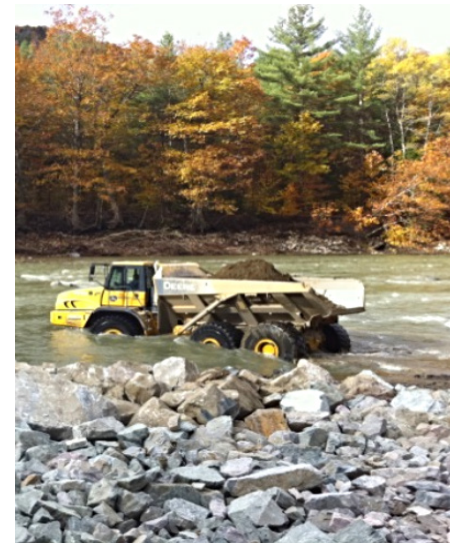
Post-Irene River Work, Bethel