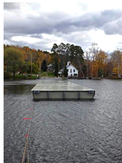
Brookfield Floating Bridge