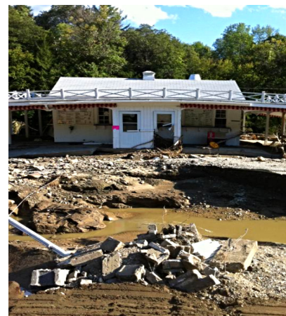
Tropical Storm Irene damage to the White Cottage, Woodstock