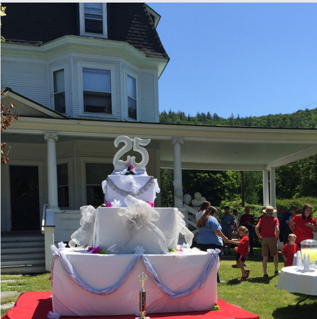
Park House, Rochester

To read more details about this and other FHLB projects, go to: http://www.fhlbboston.com/communitydevelopment .