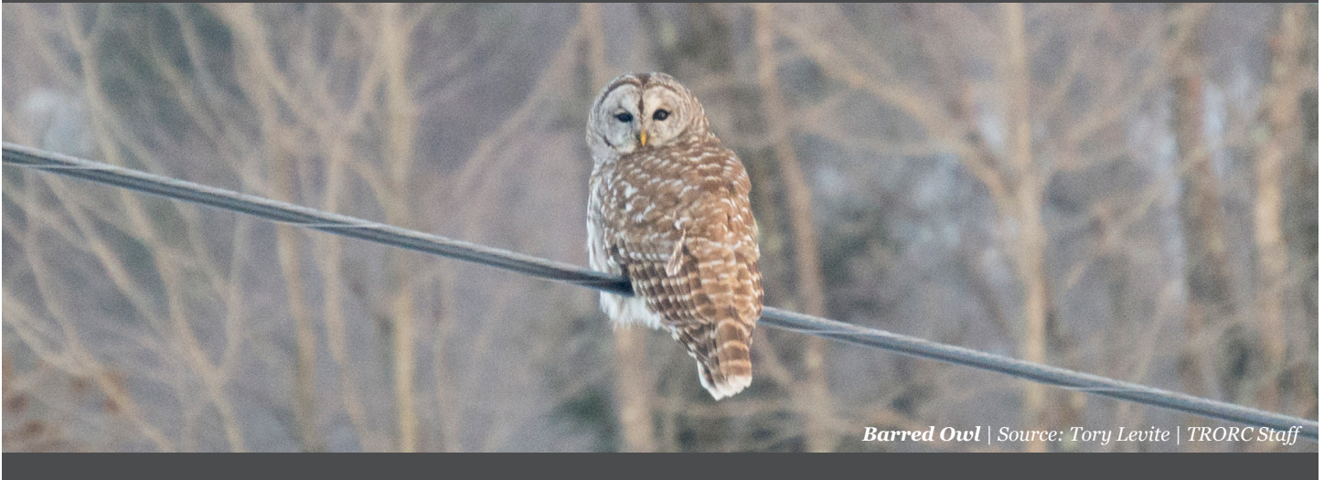
Barred Owl