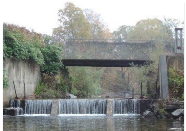
Above: Geer Dam in West Fairlee, VT that is in final engineering design for removal.