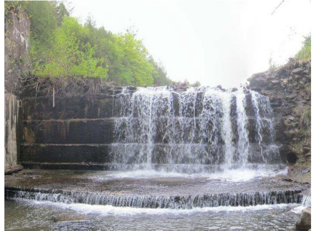
Norwich Reservoir Dam in Norwich, VT slated for removal.

Go to http://www.trorc.org/about-data/# to check it out! If there is something not on the list that you are looking for, call our office at (802) 457-3188 and ask for Pete Fellows.