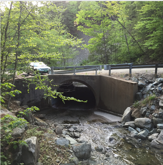
Churchville Culvert on Howe Brook will be replaced with a concrete deck bridge to better handle floods