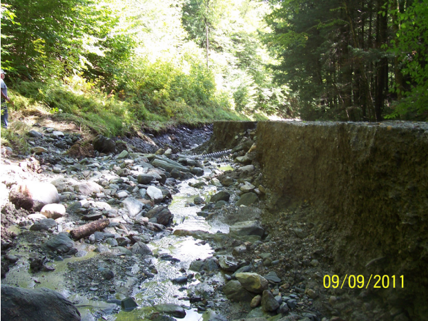
Damage of Taggart Hill Road in Stockbridge after Tropical Storm Irene. The road will be moved 50 ft away from the stream to prevent future washouts.