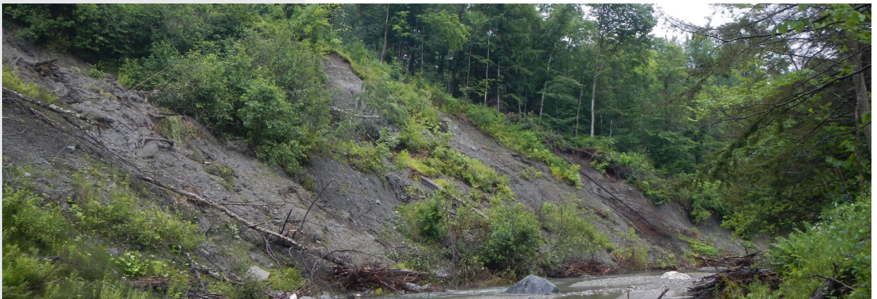
Mt. Hunger Road bank slide in Barnard is set for stabilization this summer.