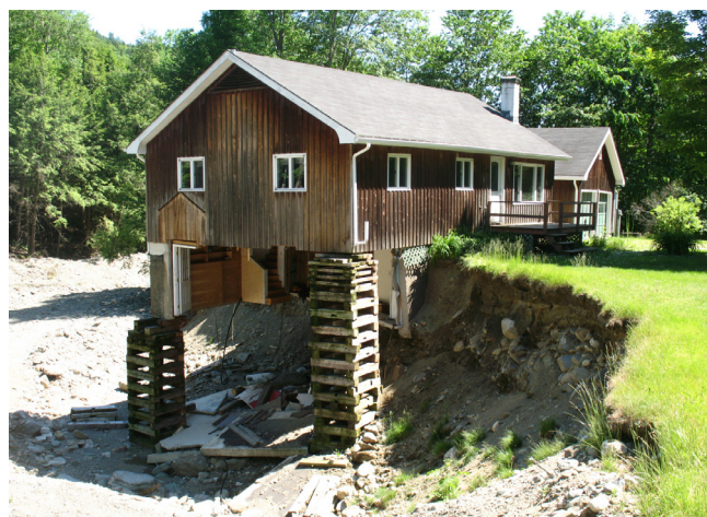
Property in Rochester slated for buyout.