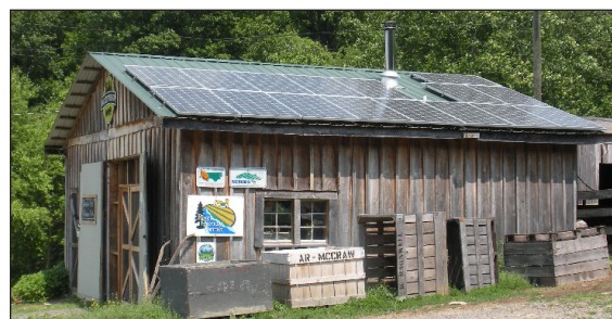
solar panels on Hickory Nut Gap store