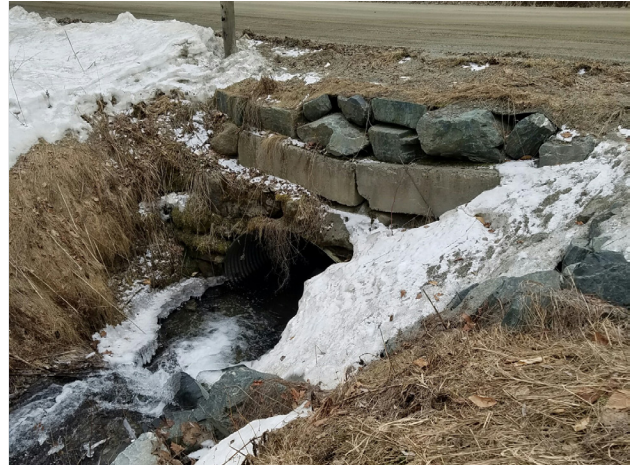
This culvert on Allen Hill Road in Pomfret is one of several construction grants awarded. This culvert will be upsized and the stone headers will be adjusted for better road support.

To access the application, go to http://vtrans.vermont.gov/highway/local-projects/bike-ped . For assistance in applying to this program, contact Rita Seto at rseto@trorc.org .