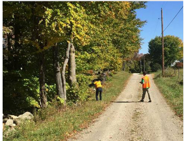
TRORC Staff conducting a road erosion inventory in Bridgewater.