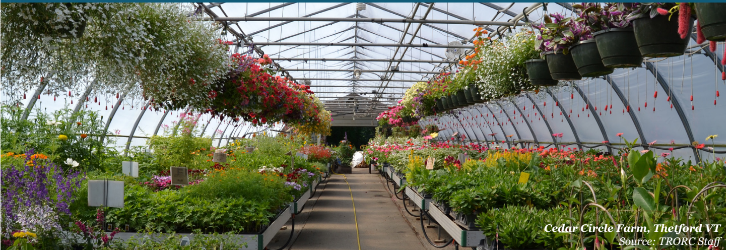
Cedar Circle Farm, Thetford VT