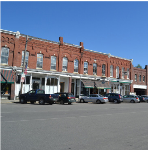
The South Royalton Village in Royalton has State Village Designation, where TRORC assisted in the application process.