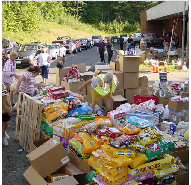
Roles of an EMD can include gathering supplies and opening a shelter in their community if a disaster were to hit.