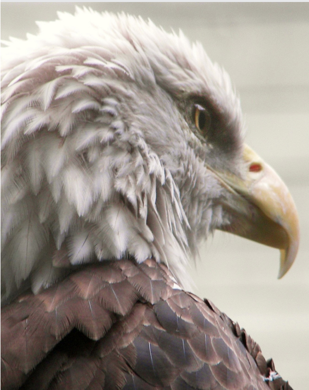
Wildlife such as bald eagles use connected forest blocks as sources of shelter and food.

For more information on the Village Center Designation program, please contact Chris Damiani at cdamiani@trorc.org .