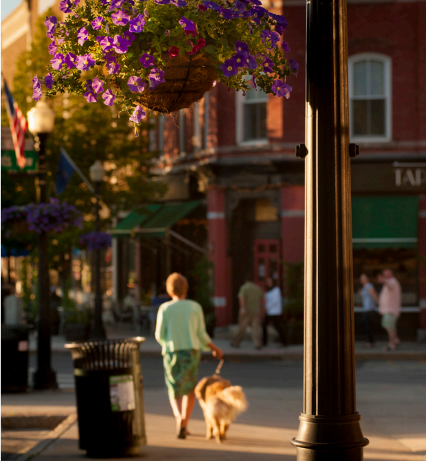
Downtown Randolph is a state designated area.