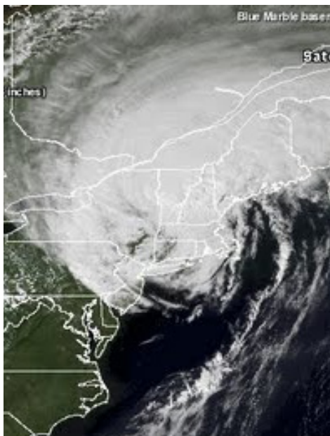
Tropical Storm Irene over New England in August 2011.

Registration by November 10th is highly recommended by going to our calendar at www.trorc.org/calendar .