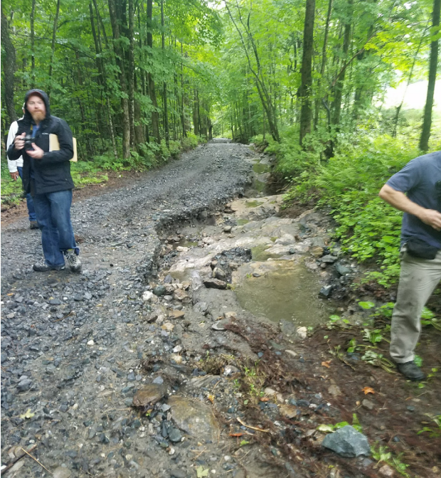
FEMA looks at road erosion in Strafford with VTrans, VEM, and TRORC staff.