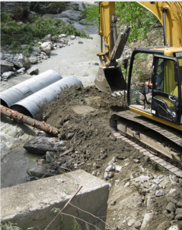
Emergency construction takes place on Stony Brook Road in Stockbridge after Tropical Storm Irene

You can also contact your local River Engineer for information, which you can find here: http://dec.vermont.gov/sites/dec/files/wsm/rivers/docs/RME_districts.pdf .