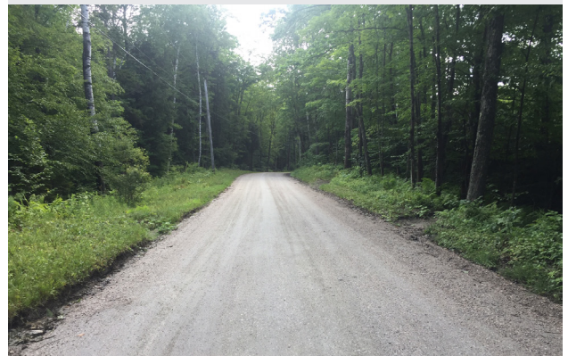
Cox District Road in Bridgewater will be undergoing construction this fall to bring this section up to MRGP standards with new ditching.