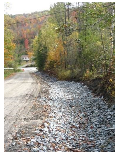
Pictured: Stone-lined ditch