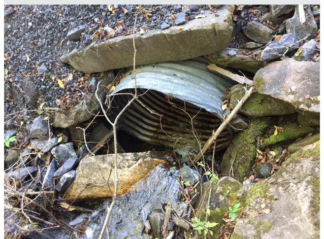
A grant was applied for to install a larger culvert to handle high rain events and prevent erosion on the road. This culvert is located on Blackhawk Road in Chelsea.