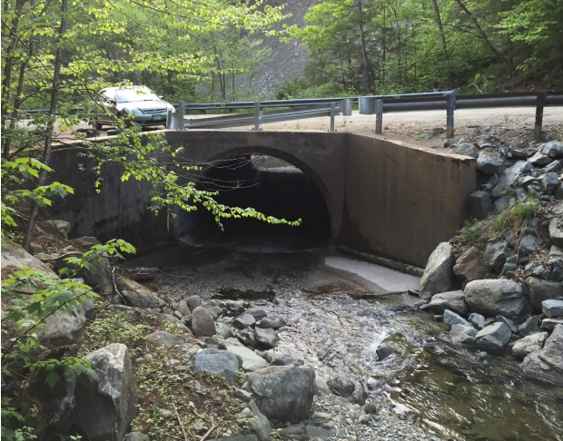
Before (above) and after (below) of the Churchville Culvert replacement in Hancock.