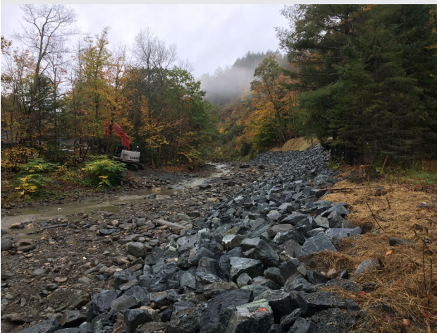
After picture of the Barnard bank stabilization.