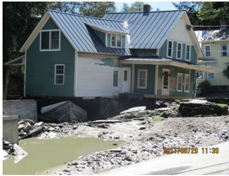
Photo caption: A flood-damaged structure following TS Irene.