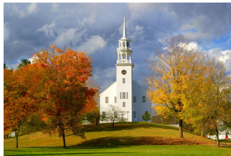
Strafford, VT

Applications for assistance are collected on a rolling basis and are first-come, first-served. More information, including eligibility criteria and how to apply, can be found here .