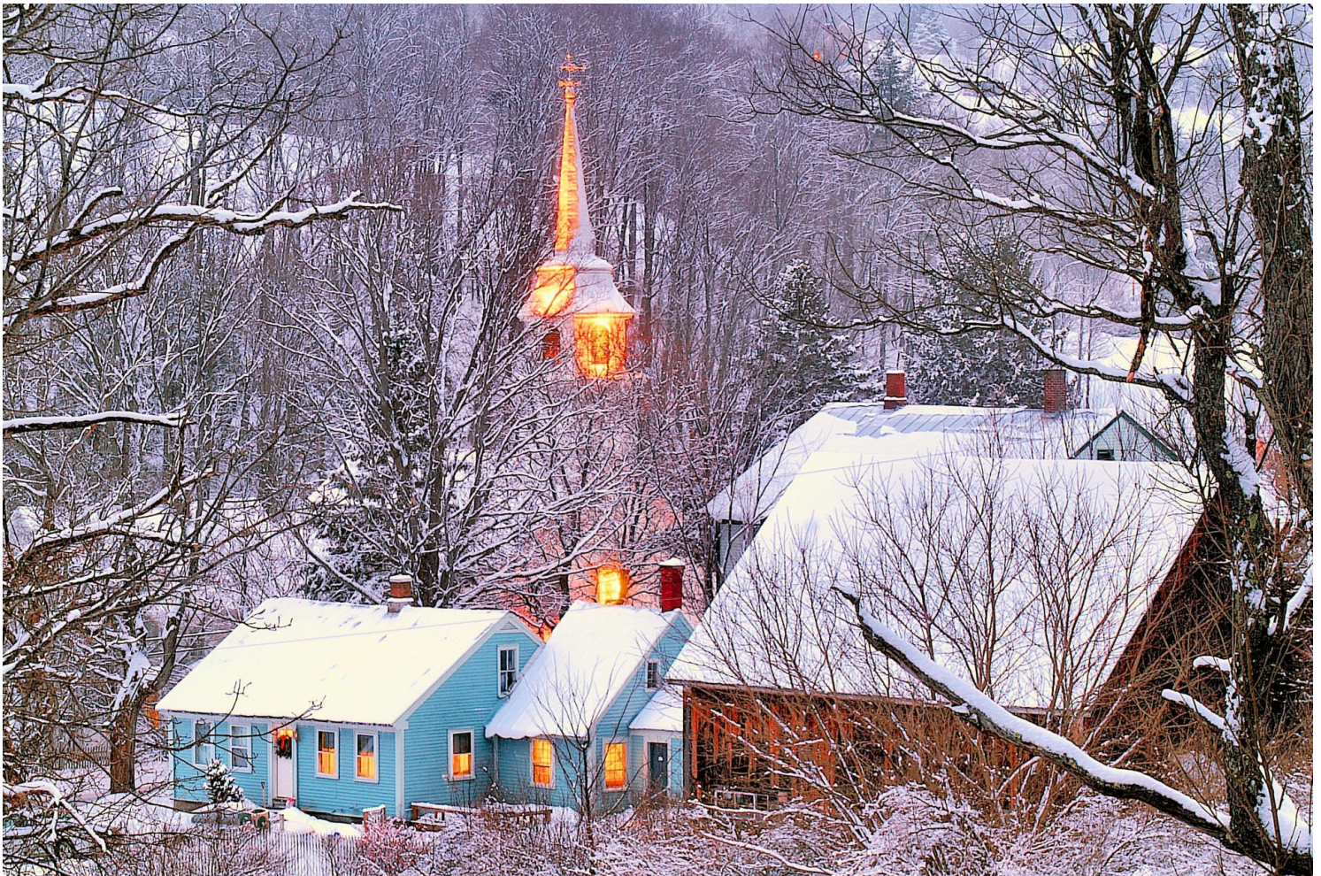
Corinth, VT