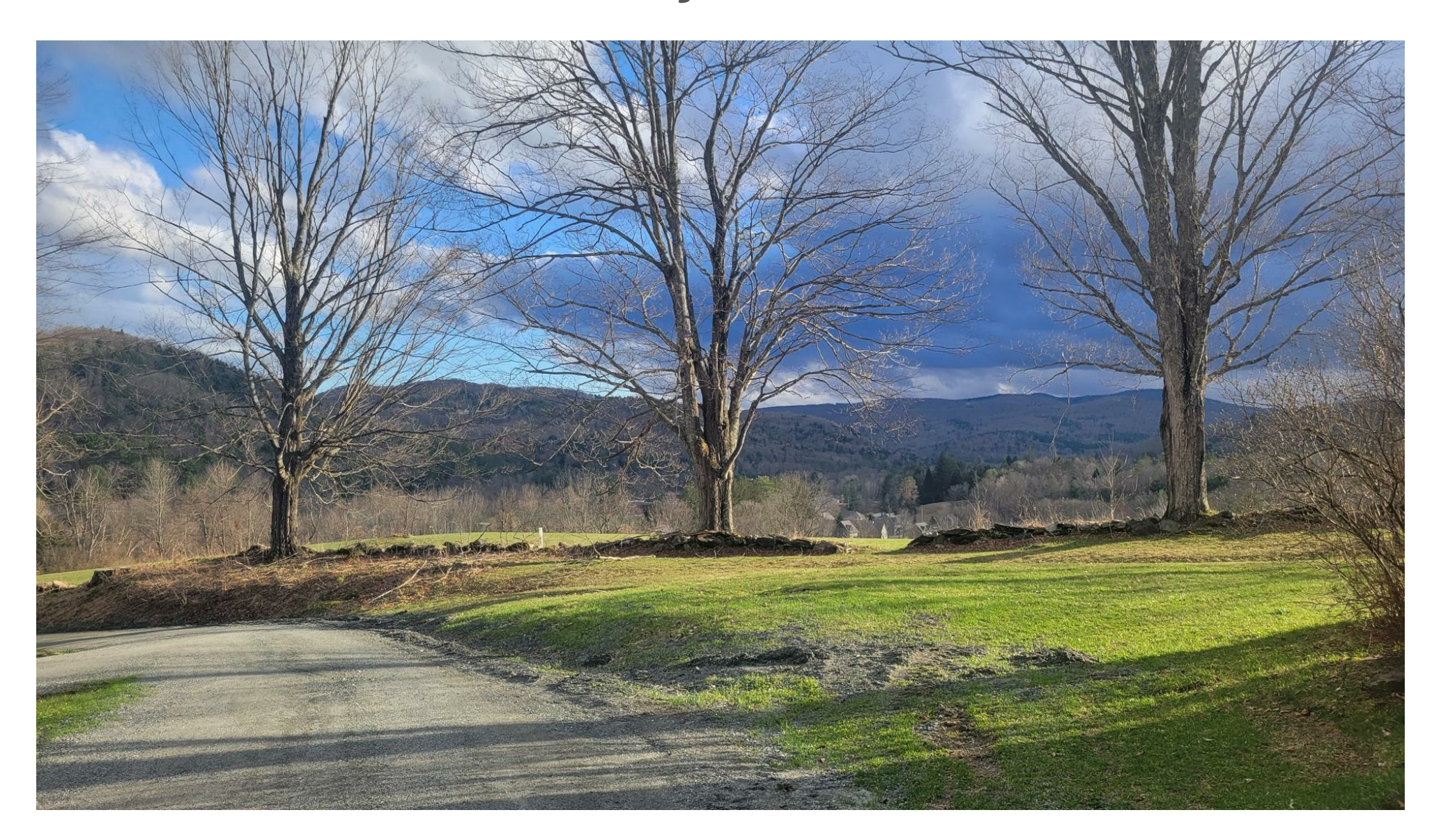
Photo Caption: Three maple trees soaking up the sun at King Farm, Woodstock.