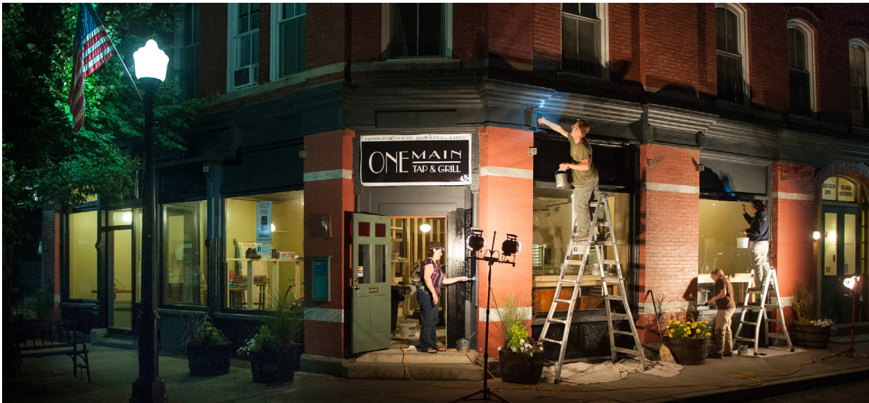
One Main Tap & Grill, Randolph

Water quality and quantity are issues that tie the regions together. All agree that improving water quality is a priority. Adjacent Regional Plans are also very cognizant of flooding as an important